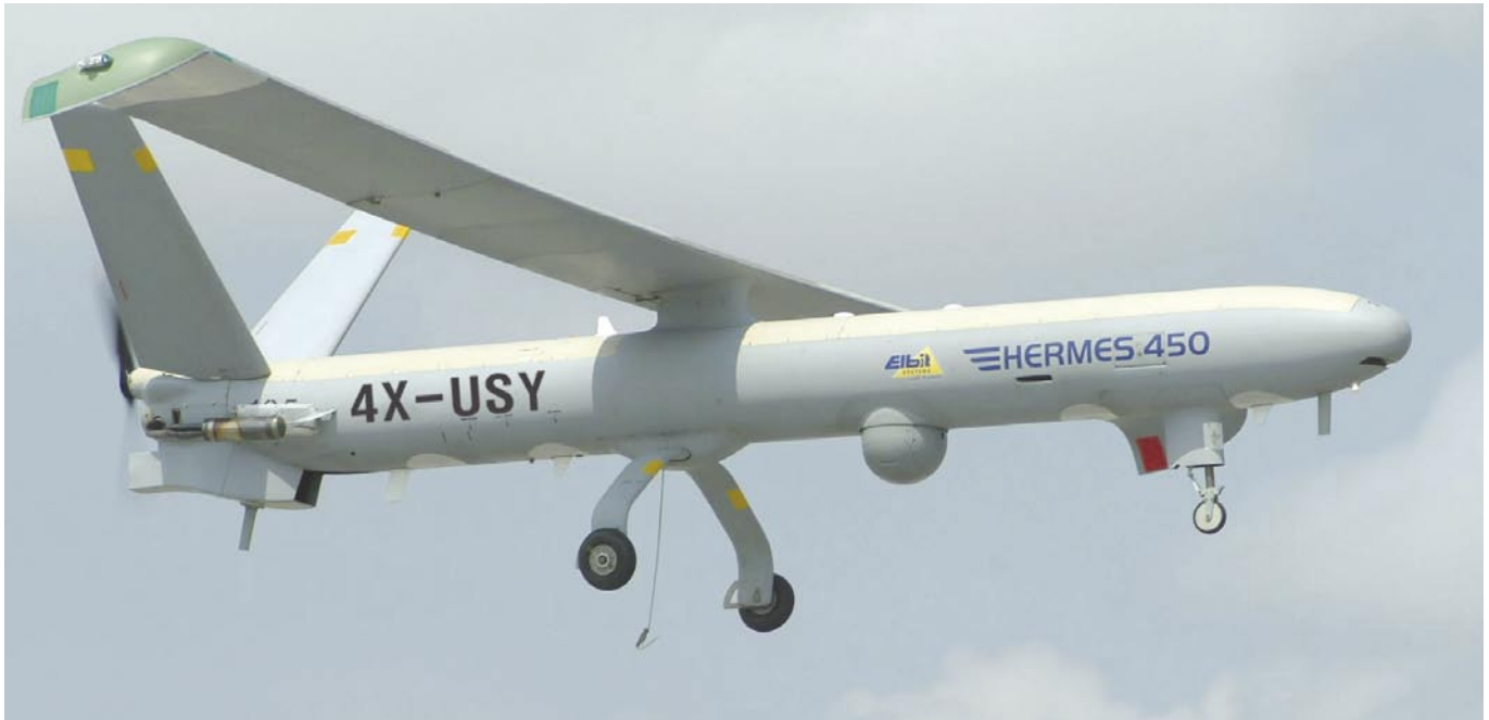
LONG ENDURANCE: Elbit Systems' Hermes 450

try newer technologies and concepts, but also help in solving issues such as certification, standardisation and formulation of air traffic regulations. Since the UAV are quite susceptible to adverse weather conditions, OPAV could also help in developing procedures and limits for weather penetration.