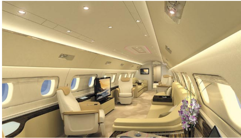
TRAVEL IN COMFORT: Inside the Embraer Lineage 1000 executive jet