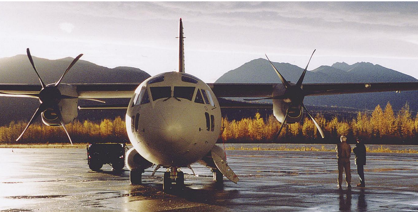
NEW ENTRANT: Alenia's C-27J Spartan