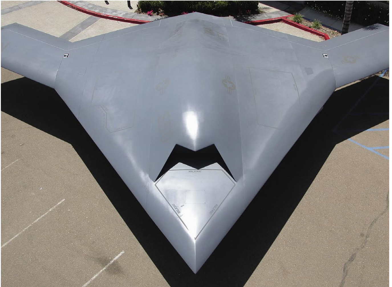
STEALTHY: The X-47B Unmanned Combat Air System