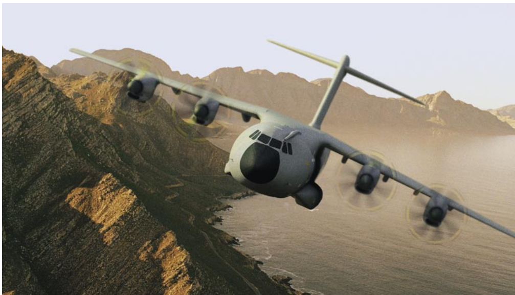
EAGERLY AWAITED: The A400M

So far as India is concerned, the success of the BrahMos missile project needs to be replicated in the Indo-Russian Multi-role Transport Aircraft (MRTA) project. In 2002, the two countries agreed to a 50-50 joint venture between Hindustan Aeronautics