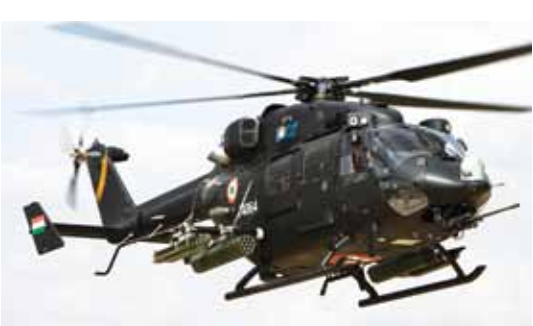
(TOP) NH90 WITH SAAB EW; (ABOVE) ALH RUDRA OF THE IAF.

CIDAS is a small and light weight variant of IDAS that provide only electro-optic sensors and a smaller controller. It is designed for the protection of aircraft against Man Portable Air Defence Systems (MANPADS), and laser based threats, many of which are encountered in the currently prevailing peacekeeping environment.