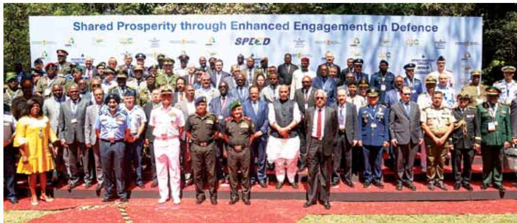
DEFENCE MINISTER RAJNATH SINGH HOSTED THE DEFENCE & DEPUTY DEFENCE MINISTERS OF 27 COUNTRIES AT THE DEFENCE MINISTERS' CONCLAVE ON THE SIDELINES OF AERO INDIA 2023

The Defence Minister reaffirmed India's stand for a rules-based international order, in which "the primordial instinct of the might being right is replaced by the civilisational concept of fairness, cooperation, respect and equality amongst all sovereign nations". He asserted that untethered to any faction or alliance of one group of nations against another, India has worked ceaselessly for the upliftment of all nations, especially developing ones.