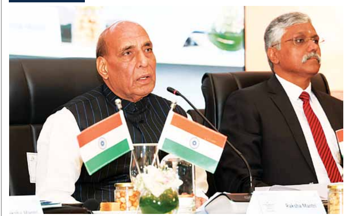
DEFENCE MINISTER RAJNATH SINGH ADDRESSING THE DEFENCE & DEPUTY DEFENCE MINISTERS OF 27 COUNTRIES