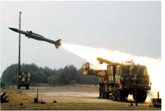
AKASH WEAPON SYSTEM

Some of the areas BEL is focussing on in non-defence include solutions for Civil Aviation sector including Air Traffic Controller Radars, Anti Drone systems, Space/Satellite Electronics, Satellite Assembly & Integration, Unmanned Systems, Solar Business, Railway and Metro solutions, Software as a Service, Network & Cyber Security, Energy Storage products for Electric Vehicles (Li-ion & Fuel Cells, Charging Stations, etc), Homeland Security & Smart City businesses, Smart Meters, a range of Medical Electronic and health care solutions, Artificial Intelligence, Communication Radios & Networks, Composite Shelters & Masts, etc. This wide bouquet of businesses in nondefence would play a key role in driving BEL's growth in the coming years.