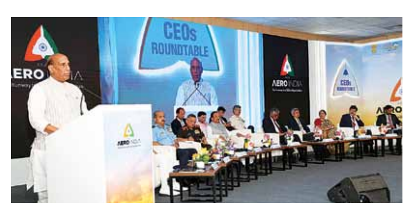
DEFENCE MINISTER RAJNATH SINGH ADDRESSING OVER 70 CEOS OF LOCAL AND GLOBAL ORIGINAL EQUIPMENT MANUFACTURERS (OEMS) DURING A ROUND TABLE

This platform was to forge partnerships between domestic and global Industries of the aerospace and defence sector to address the present and future global