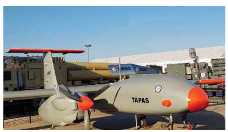
(LEFT) A MODEL OF AMCA THE ADVANCED MEDIUM COMBAT AIRCRAFT; (RIGHT) TAPAS IS A MALE UAV WITH AN OPERATING ALTITUDE OF 30,000 FT AND A RANGE OF 250 KMS.

in the UAV segment. DRDO as the R&D wing of India's defence ecosystem has demonstrated indigenous ability in carrying out missions with a fully operational decentralised swarm of 25 drones in assorted formations (drone swarms) wherein the drones are capable of distributive sensing and autonomous decision-making. Unmanned aerial vehicles today are gradually evolving into major deterrents as well as a major avenue for offensive operations. DRDO has also successfully demonstrated capabilities in stealth combat drone through the demonstrator called "Stealth Wing Flying Testbed". The airframe, undercarriage and entire flight control and avionics systems have reportedly been indigenously developed. UAVs are no doubt a very critical component when it comes to the evolution of aerial warfare in the coming decades. The shape, form and impact may vary but fundamentally unmanned systems are the future.