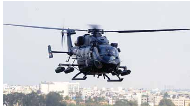
HAL LEADING THE INDIGENISATION EFFORTS: (LEFT) HTT-40; (RIGHT) RUDRA

A unique flying display of HAL's indigenous platforms (both fixed and rotary wing) aptly titled 'Aatmanirbhar Formation Flight' is a part of the flying display during the 13th edition of Aero India-2021. HAL is displaying its prowess in defence and aerospace centered on the theme 'Conceive. Indigenise. Collaborate' at the world's first hybrid exhibition.