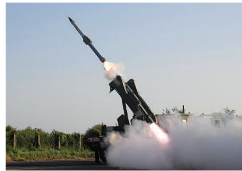
(LEFT) ENHANCED PINAKA ROCKET SYSTEM; (RIGHT) QUICK REACTION SURFACE TO AIR MISSILE SYSTEM