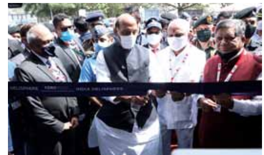
DEFENCE MINISTER RAJNATH SINGH INAUGURATING THE INDIA PAVILION

In line with the theme, HAL's Rotary platform LUH (Light Utility Helicopter) Military is the center-