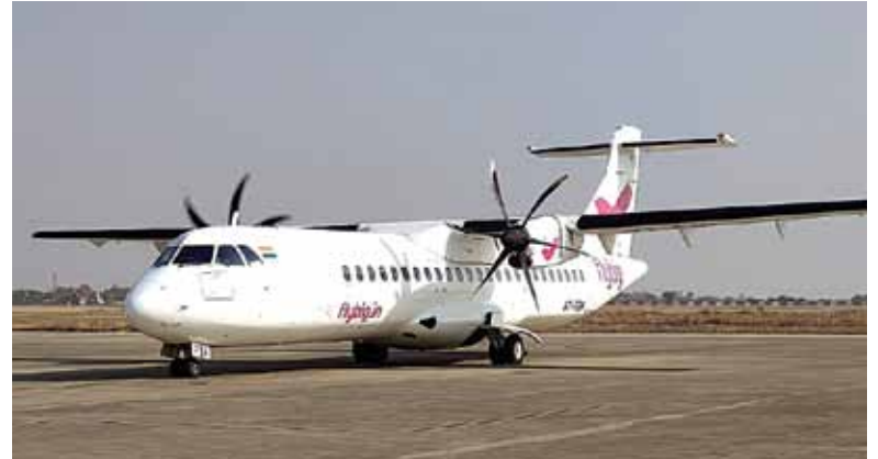
THE NEW LOW-COST CARRIER, FLYBIG IS BETTING ON REGIONAL CONNECTIVITY, USING AN ATR72, AND CONNECTING SMALLER TOWNS UNDER THE GOVERNMENT'S UDAN SCHEME