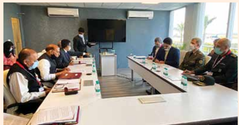
DEFENCE MINISTER RAJNATH SINGH MEETING THE IRANIAN DEFENCE MINISTER, BRIGADIER GENERAL AMIR HATAMI ON THE SIDELINES OF AERO INDIA 2021