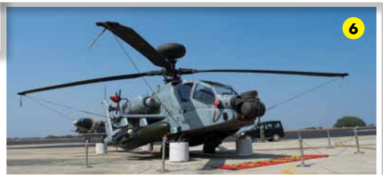
1. RAFALE FLYPAST DURING THE INAUGURATION 2. B-1B LANCER REITERATED INDO-US RELATIONSHIP 3. ATMANIRBHAR BHARAT KI UDAN - TEJAS LOOKING UP 4. MESMERISING DISPLAY OF SARANG AEROBATIC TEAM 5. C-17 FLANKED BY FLANKERS 6. APACHE GUNSHIP ON THE TARMAC ENTHRALLING THE CROWD 7. SURYAKIRANS LINE-UP ON THE RUNWAY AWAITING THEIR TURN 8. LCA TEJAS, HTT-40 BASIC TRAINER & INTERMEDIATE JET TRAINER FROM THE KITTY OF HAL SHOWING INDIA'S GROWTH TOWARDS SELF-RELIANCE 9. IAF'S RAFALE RECONFIRMING ITS COMMITMENT TOWARDS INDIAN SKIES 10. B-1B LANCER FLYBY DURING THE SHOW TO CONVEY THE MESSAGE FROM U.S. GOVERNMENT TOWARDS CEMENTING THE BILATERAL RELATIONSHIP