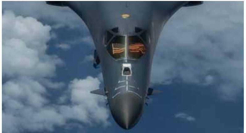
GETTING CLOSE: B-1B LANCER FLIES OVER THE EAST CHINA SEA DURING A TRAINING MISSION

FLYBY OF US AIR FORCE B-1B LANCER AT THE SHOW. HERE IS ALL YOU NEED TO KNOW ABOUT THIS VINTAGE BOMBER.