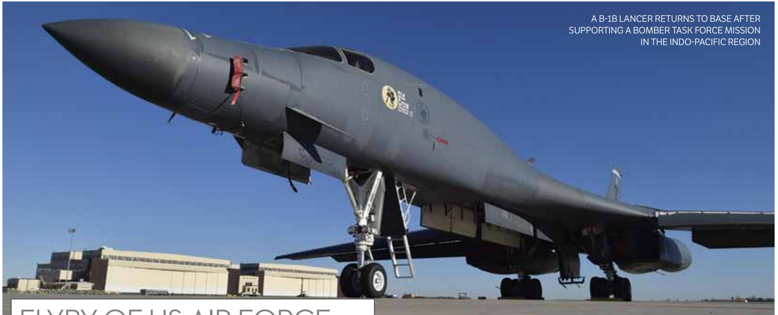
A B-1B LANCER RETURNS TO BASE AFTER SUPPORTING A BOMBER TASK FORCE MISSION IN THE INDO-PACIFIC REGION

FLYBY OF US AIR FORCE B-1B LANCER AT THE SHOW. HERE IS ALL YOU NEED TO KNOW ABOUT THIS VINTAGE BOMBER.