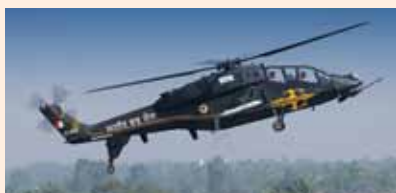
HAL'S LIGHT COMBAT HELICOPTER SHOWING ITS MIGHT DURING THE SHOW

INDIA PAVILLION: WITH THE THEME OF ROTARY WING CAPABILITIES IN INDIA, IT IS THE HIGHLIGHT OF AERO INDIA 2021 3