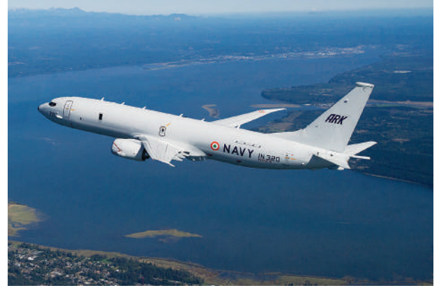
(LEFT) F/A-18 BLOCK III SUPER HORNET; (RIGHT) P-8I OF THE INDIAN NAVY