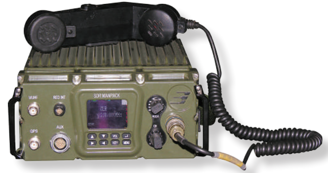
(LEFT) AIR DEFENCE FIRE CONTROL RADAR; (RIGHT) SOFTWARE DEFINED RADIO (SDR)