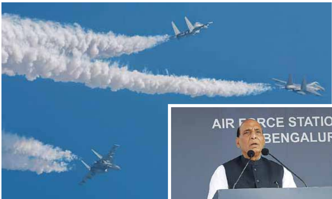
(ABOVE) AERO INDIA 2021 TAKES OFF: SPECTACULAR DISPLAY BY IAF'S SUKHOIS; (RIGHT) DEFENCE MINISTER RAJNATH SINGH INAUGURATES THE SHOW