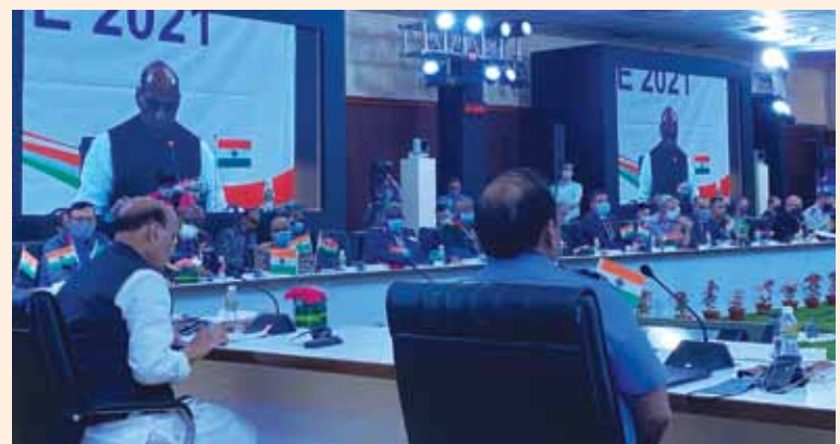
DEFENCE MINISTER RAJNATH SINGH ADDRESSING THE INAUGURAL SESSION OF CHIEFS OF THE AIR STAFF CONCLAVE AT AERO INDIA 2021